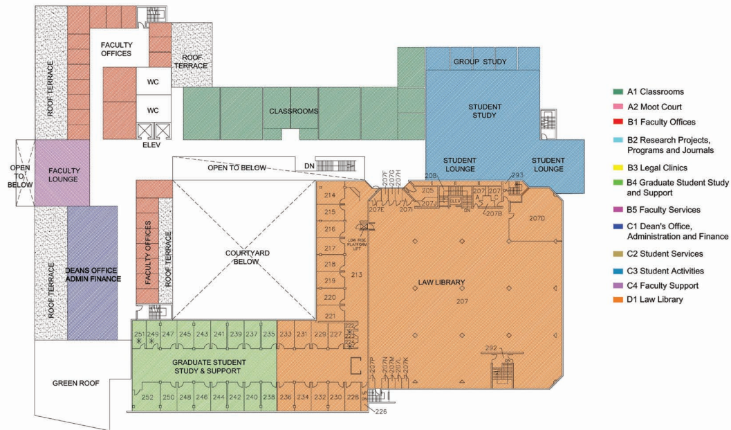
OPTION 3 - Second Level

Client/Contractor: UBC Land & Building Services