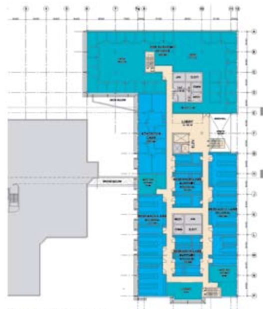
THIRD LEVEL PLAN