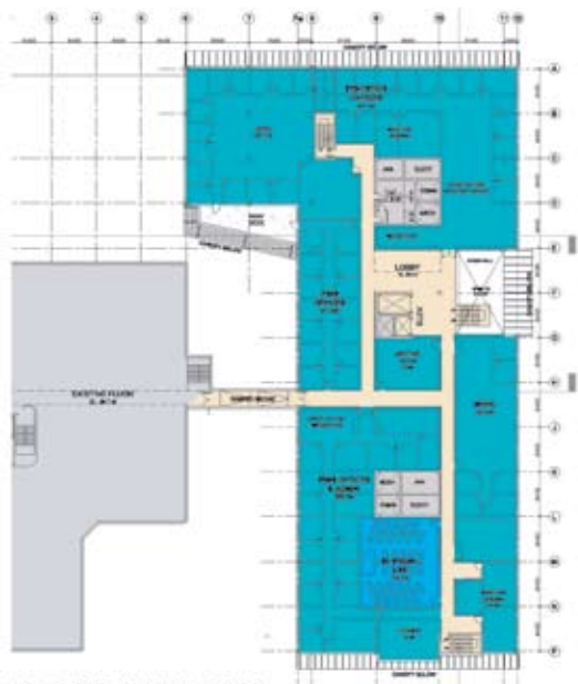
SECOND LEVEL PLAN