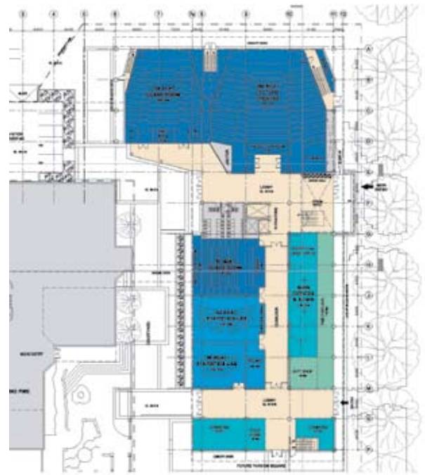
MAIN LEVEL PLAN